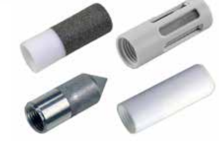
Protection caps for harsh enviroment