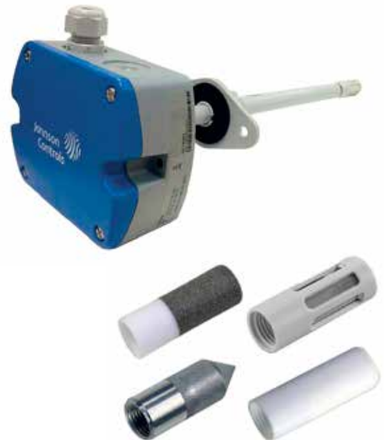
Protection caps for harsh environment